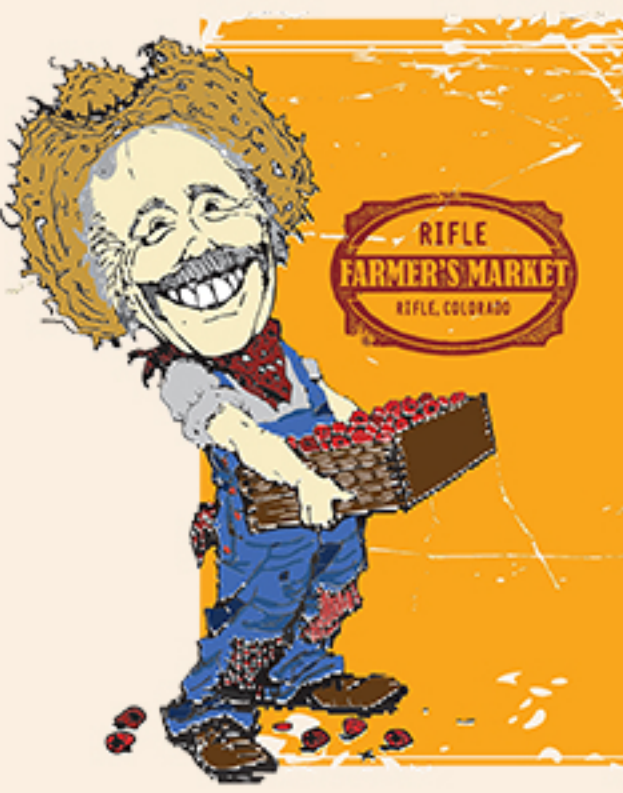
Fridays, June 21st - Sept 6th 4 - 8 pm