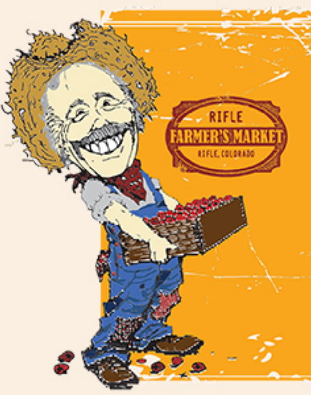
Fridays, June 16th - Sept 1st 4 - 8 pm